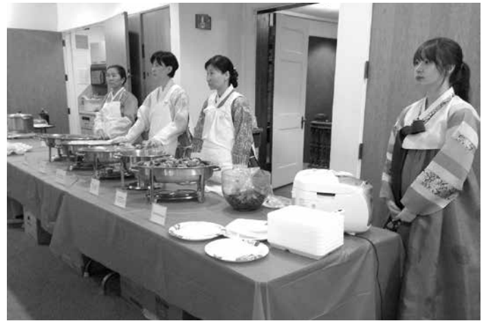
Korean Cooking Demonstration at the library, presented by the Korean Spirit and Culture Project