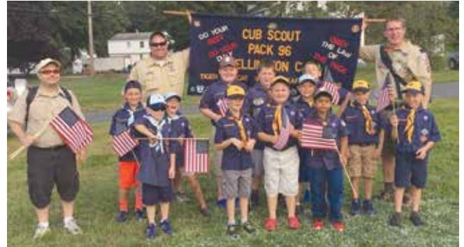
Cub Scout Pack 96 marches in the EVFD Fireman's Parade