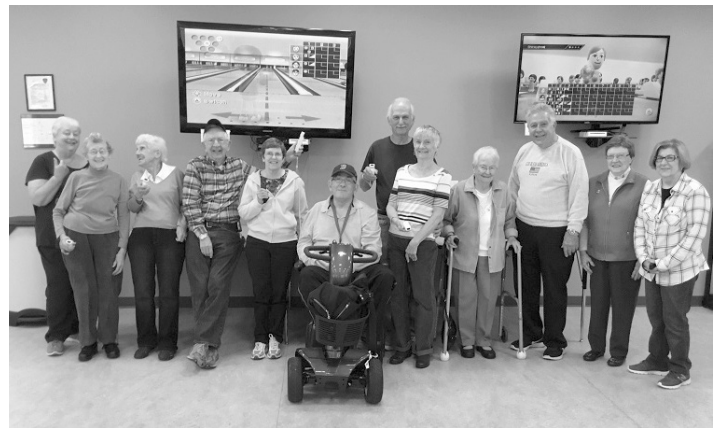
Seniors enjoy Wii Bowling