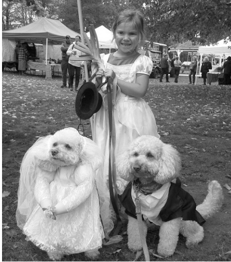
Adorable participants in the Annual Halloween Pet Parade at the Farmers' Market.

The 5th winter season of the Ellington Farmers' Market kicks off on Saturday November 19th from 2:00 to 4:00 pm at the YMCA, 11 Pinney Street. The winter market organizers credit its success to