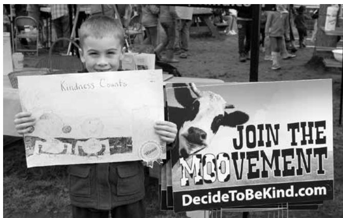
Decide to Be Kind Poster Contest Winner

at Ellington Youth Services at dstauffer@ellington-ct.gov . Written parental permission for anyone under 18 is required to post the video or portions of it on our YouTube Channel, website or Facebook page. Two $50 Visa Gift Cards will be awarded, one for a youth and one for an adult. Visit the website at decidetobekind.com for more information on the Decide to Be Kind campaign and the contest. Every video should include your name, email address and phone number. The contest ends December 31.