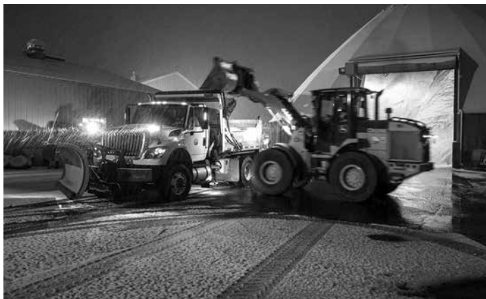
Loading plow trucks for de-icing of roads during snow event.

SECURE YOUR MAILBOX – Residents are asked to make sure their mailboxes are secured and sturdy before the winter snow begins. Mailboxes damaged by snow load will not be repaired by the Town.